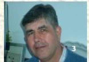
Image by Hart, Francis Russell. (from old catalog) [No restrictions], via Wikimedia Commons